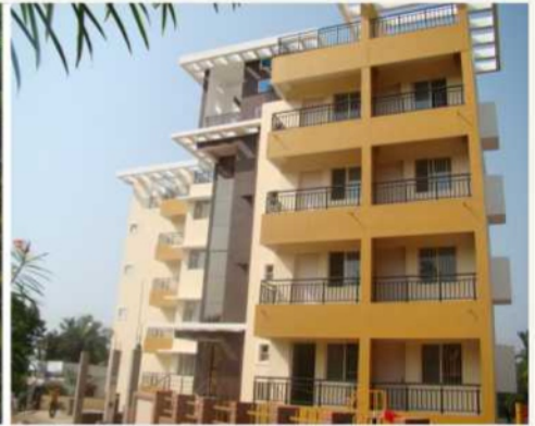
SILENT MEADOWS MANIPAL