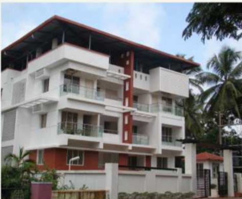
ANNAPPA HERITAGE UDUPI